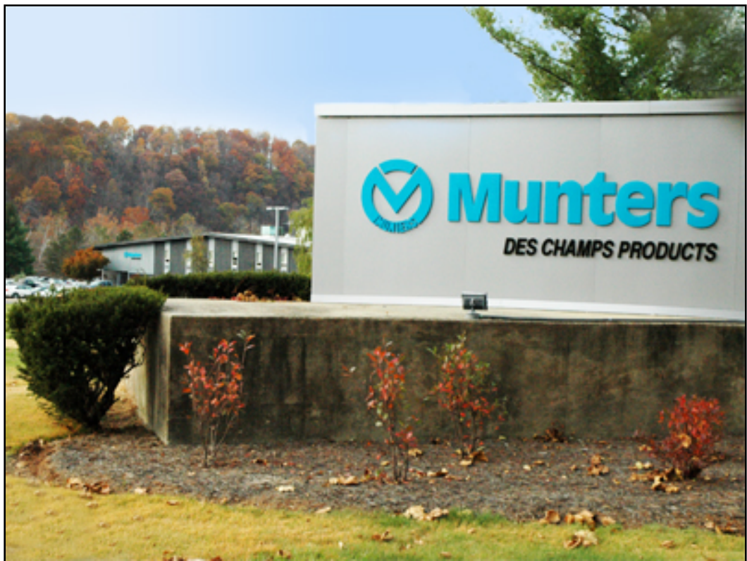
Munters Manufacturing Facility

Situated in the heart of the I-81 Corridor with the Allegheny and Blue Ridge mountains bordering the community to the east and west; great views are to be expected. Supplementing those views are Virginia Military Institute, Washington and Lee University, Southern Virginia University, and Dabney S. Lancaster Community College, a transportation network that includes two interstates, telecommunications that rival larger cities, a lower than average cost of doing business, and an industrial heritage ranging from advanced manufacturing to wood products. With all of this, it is easy to see why Good Views Reveal Great Vision.